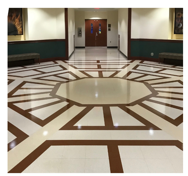
EPIC® High-Gloss Finish

"It's like night and day. For some of the floors that are still coated with wax, people will ask 'What is wrong with theses floors? Why don't they look shiny like those [EPIC®] floors?' We get nothing but compliments with EPIC®." – Joe Scollo, UNC Charlotte EVS Manager